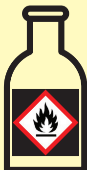
Highly flammable (F) and Extremely flammable (F+)