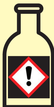
Harmful (Xn) Irritant (Xi)