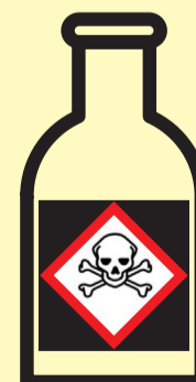
Toxic (T) and Very toxic (T+)