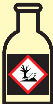
Dangerous for the environment